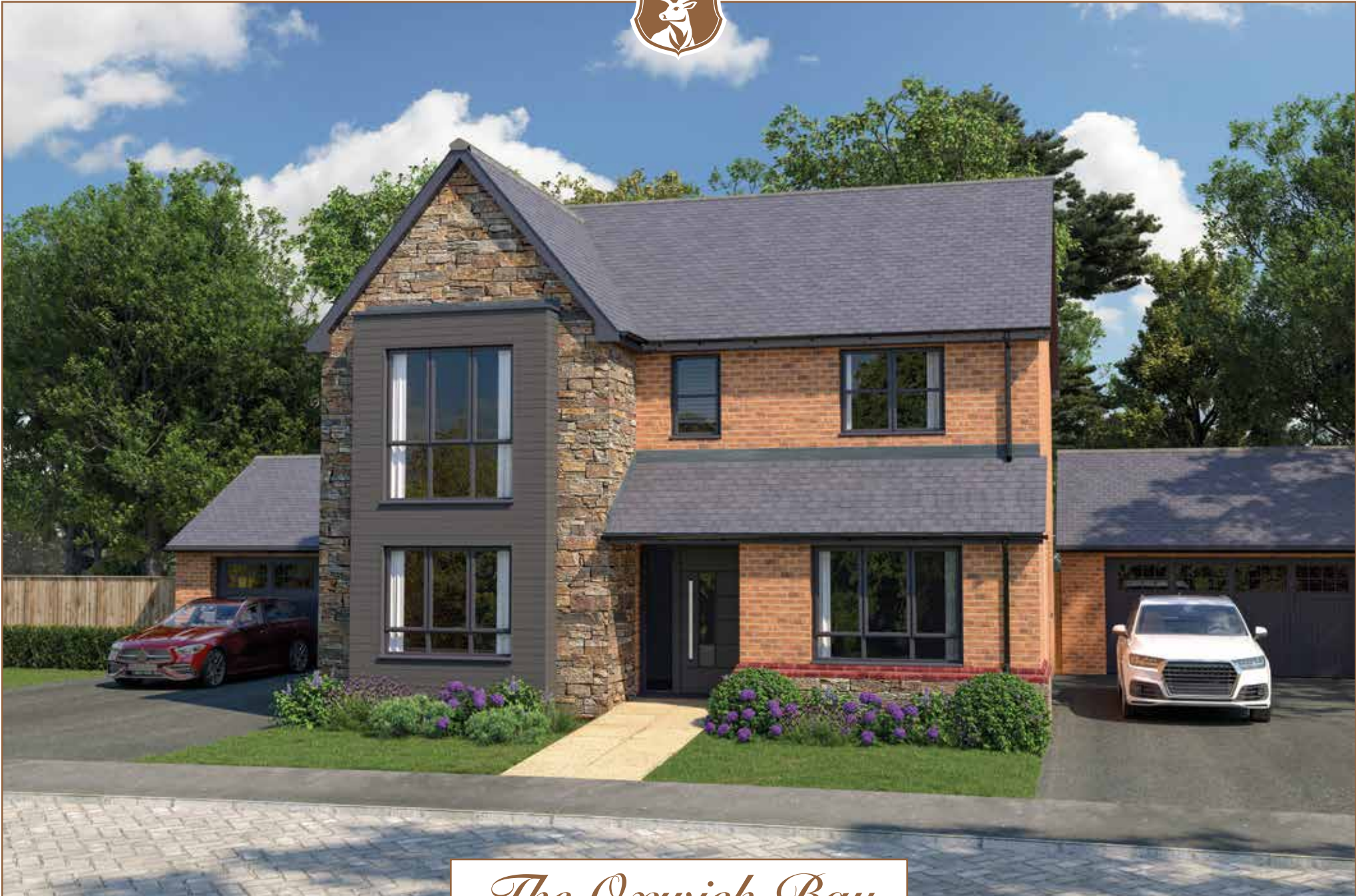
The Oxwich Bay